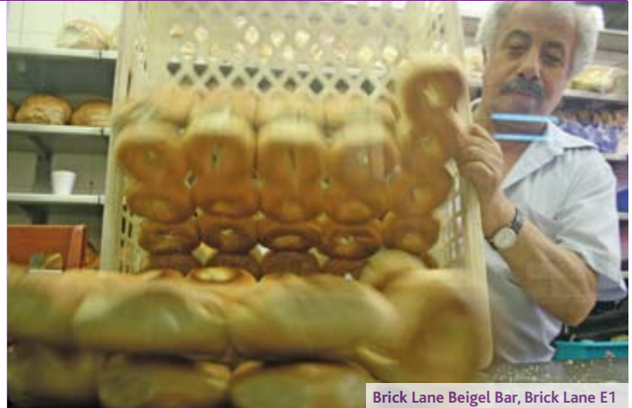
Brick Lane Beigel Bar, Brick Lane E1