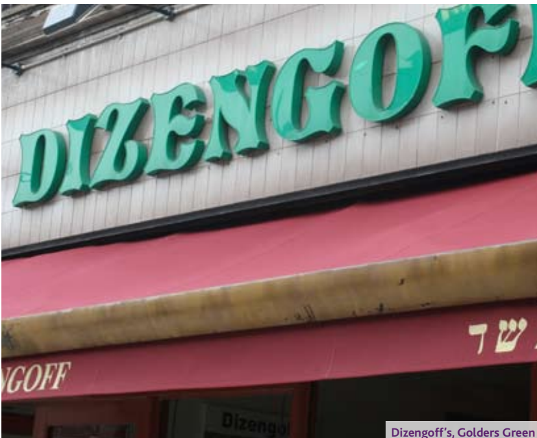
Dizengoff's, Golders Green

Jewish people in London can be found in all areas of the capital's life and make a strong contribution to the city's social, economic and cultural life, boasting many writers, journalists, artists and academics as well as leaders in the areas of business and finance.