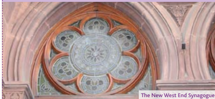
The New West End Synagogue

The leading Anglo-Jewish newspaper, includes entertainment and cultural information and listings.