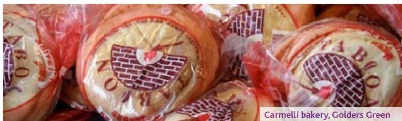
Carmelli bakery, Golders Green

From the late 1800s to just before World War II, thousands of Jewish people from Russia and Eastern Europe arrived in London, settling into the East End around Whitechapel and Stepney , close to where their ships had docked. Many people living in London today are descendants of these East End immigrants and they have had a lasting impact on the character of the area. The streets around Whitechapel thronged with Jewish cabinet makers, tailors, shoemakers and cigarette makers, who rubbed shoulders with actors, artists and musicians. Artists such as Mark Gertler and poets, including Isaac Rosenberg, emerged from the area's flourishing artistic scene, while Yiddish Theatre, Jewish newspapers and political organisations thrived.