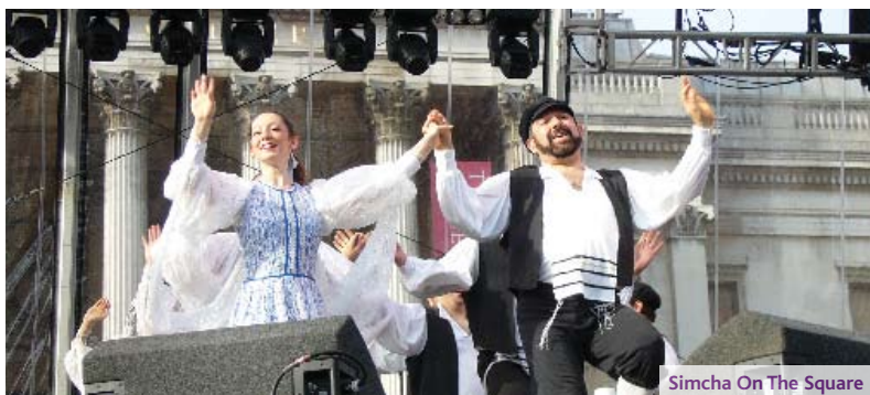
Simcha On The Square

London Jewish Museum of Art presents exhibitions, publishes catalogues and organizes competitions, lectures and children's activities.