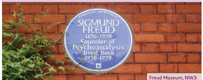
Freud Museum, NW3

Freud Museum 20 Maresfield Gardens, NW3 5SX (020 7435 2002) • Ben Uri Gallery 10a Boundary Road, NW8 ORH • Blooms 130 Golders Green Road, NW11 8HB (020 8455 1338/ blooms-restaurant.co.uk ) • Steimatzky 46 Golders Green Road NW11 (020 8458 8289)